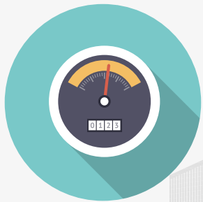
Calibration & Maintenance Checks

Integrated Facility Services' ASHRAE Certified Commissioning experts will conduct a Retro-Commissioning Project which includes: