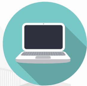
Implement Diagnostic Monitoring