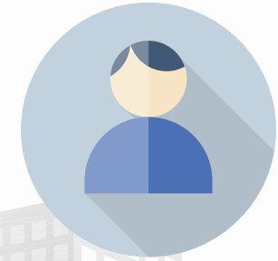
IMPROVED OCCUPANT COMFORT AND HEALTH

Benefits of Retro-Commissioning include: