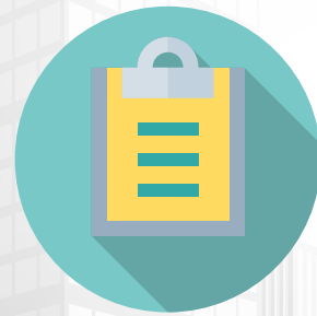
Perform Functional Testing

Benefits of Retro-Commissioning include: