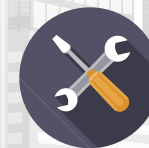
Reduced Repair Costs