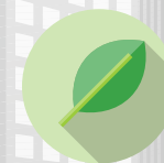
Increased Energy Efficiency